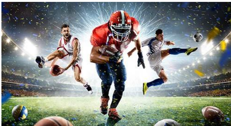
4K/UHD transmission of international live sports